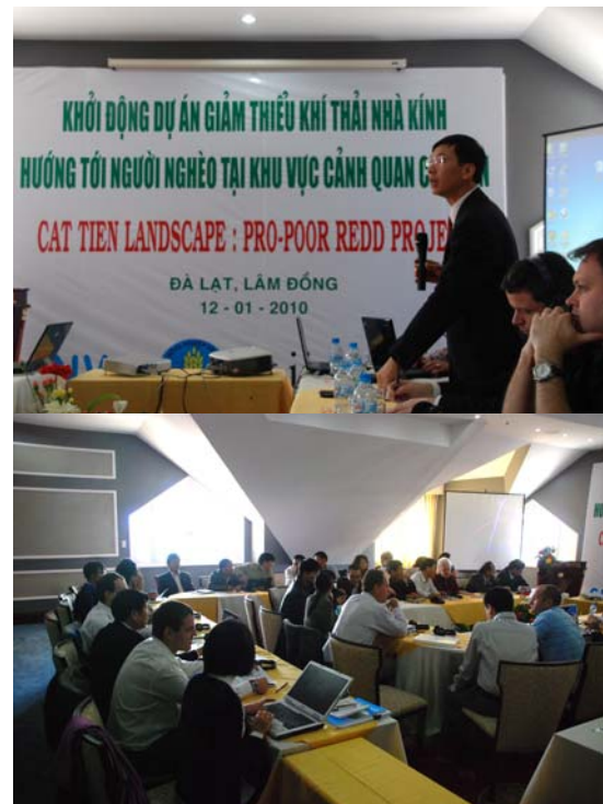
Pro-Poor REDD Project Launch Workshop Da Lat, Lam Dong - 12 January 2010

We actively seek other partners and potential donors to help develop this work in collaboration. For more information, please contact: